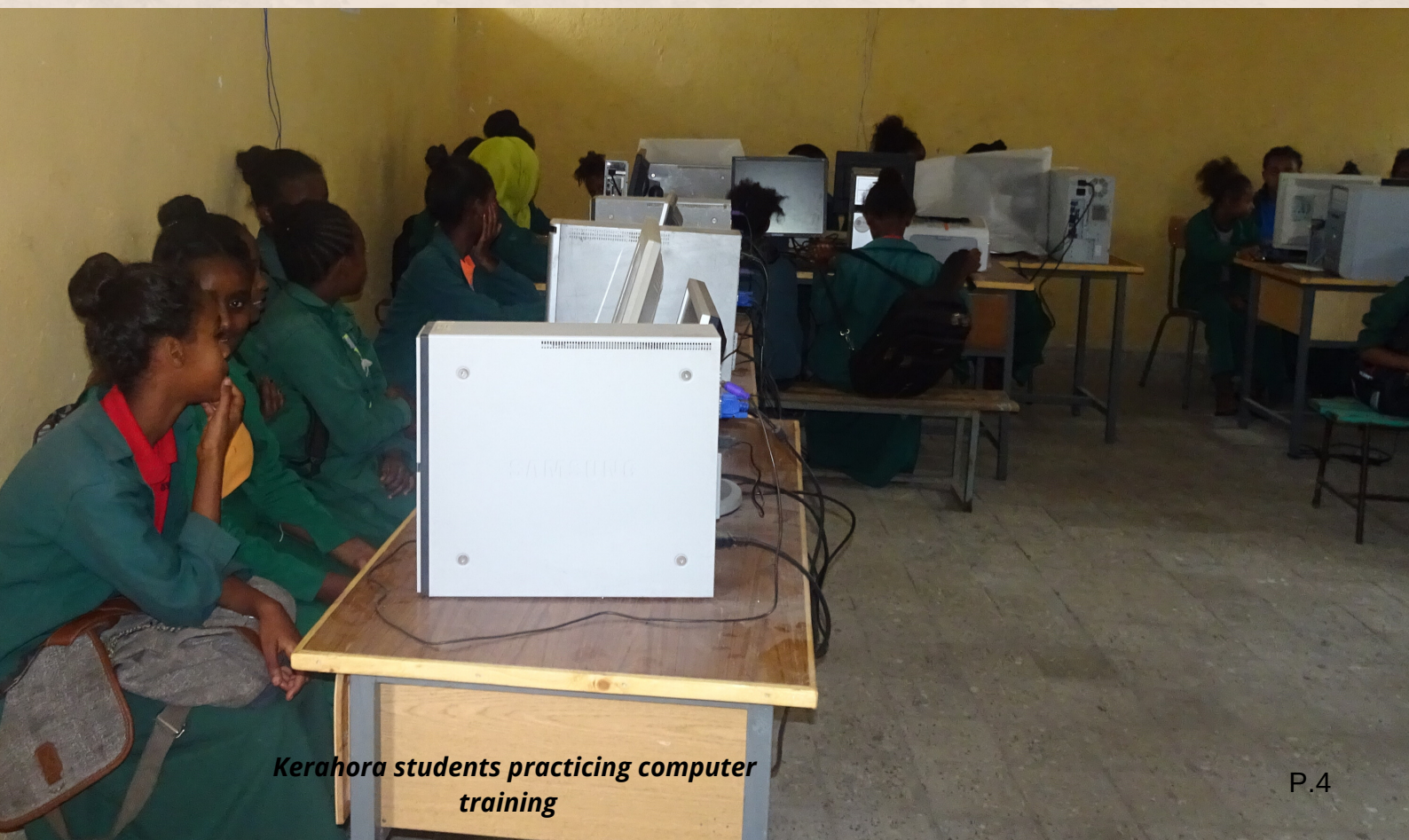
Kerahora students practicing computer training